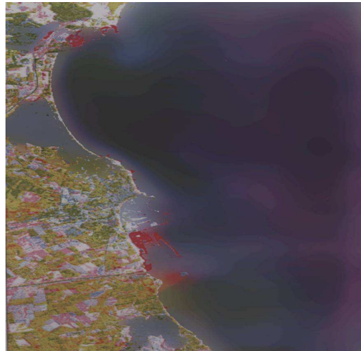
Fig. 2. Romanian Black Sea littoral changes during time period of 1975-2003.

structures and the costs for restoring the beaches and coastal zone.