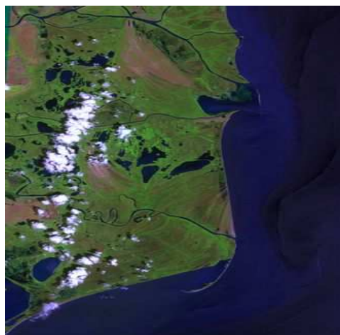
Fig. 4. ASTER image for Danube Delta area 31/05/2003.

Based on satellite data were analyzed some test areas in the vicinity of the Danube mouths where the nutrient concentration were highest, being assimilated with an expected oxygen depletion, sulfate reduction and methanogenesis in the bottom waters and the superficial sediments. Oil pollution, as a result of accidental and operational discharges in Danube river and through land-based sources continues to threaten Danube Delta ecosystems with severe impact.