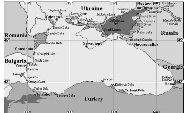
Fig. 1. Test site positioning.

spatial inhomogeneity of surface-moisture conditions (A. S. Bologna et al. 1999; N. P. Nezlin et al. 1999).